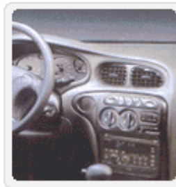
Automobile interior material

Cosmonate M-200 is widely used for panels for buildings, refrigerators, and vehicle interior materials