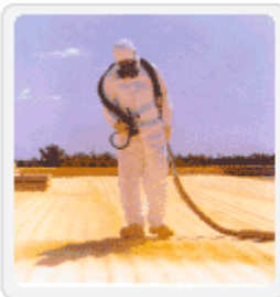
Spray heat insulation